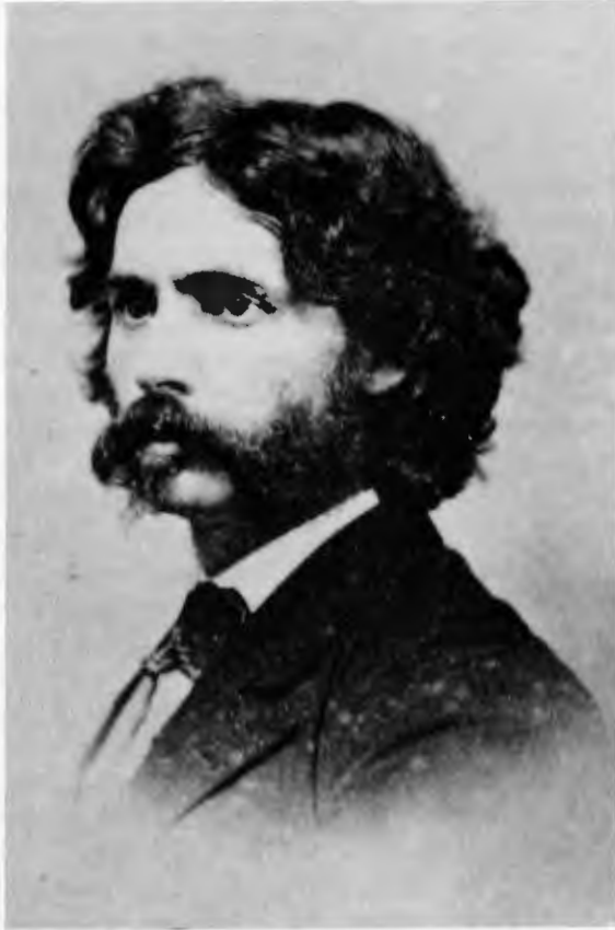
Lieutenant Colonel Samuel E. Pingree, Third Vermont Regiment.

voluntarily—and am still ready and anxious to do to the end, cost what it may. I once doubted the policy of the negro soldier bill and, in fact, of the emancipation policy of the Gov't, but I was honest in both objections; the first on the ground that negroes would be an unprofitable army, and the other on the ground that, if we must emancipate, we could do so as we occupied the country, and not beforehand exasperate the South and cool the ardor of the border states by a course that must prove fruitless until military occupation could enforce it. Today, I believe in not only the justice but the policy of a war to restore the Union. I believe not only in Universal Emancipation, both in the border & rebel states, in the former by purchase of the loyal and by force of all others, and in the latter by force and without compensation, but I have faith in the effectiveness of Negro troops and, having reason to believe they are of use, I have no scruple against using them & protecting them, if need be, by hanging a Rebel for every one of them executed or sold into