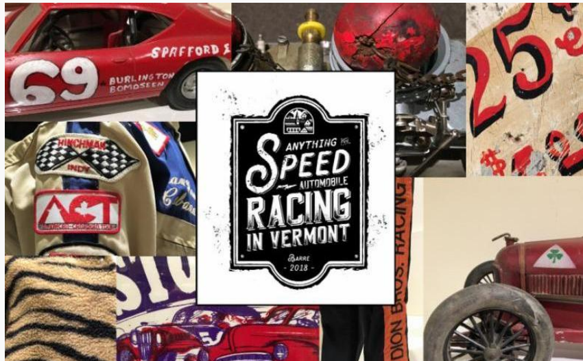
Exhibit Opens April 28!

Join us on Saturday, April 28 for the Grand Opening of the exhibit. We'll have Free Admission from 9:00 am to 12:00 pm. The exhibit will be open that day until 4:00 pm. See you at the starting line!