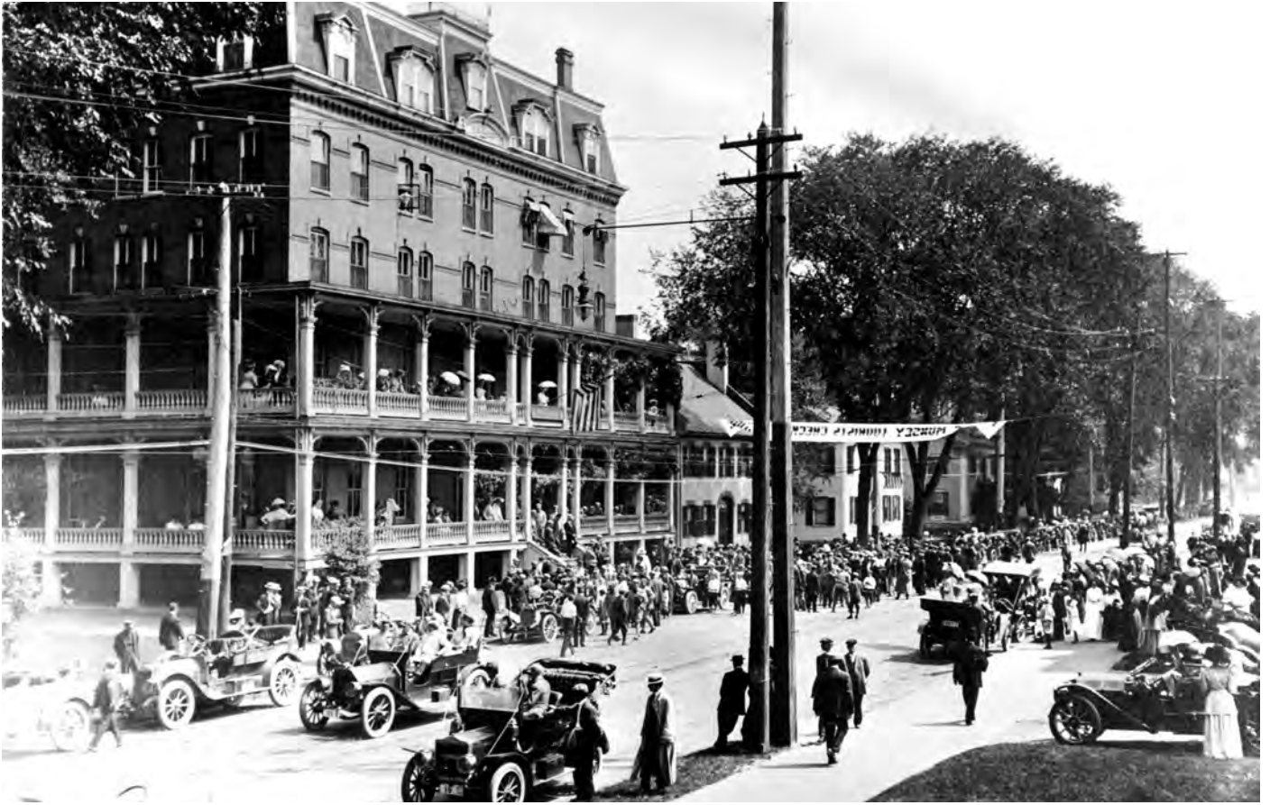
The Pavilion provided a fitting backdrop when early motorists on the 1910 Munsey Tour stopped in Montpelier. Fifty years later, the popularity of the automobile for transportation would end the Pavilion's usefulness as a hotel.

preservation of the building simply did because they did not like its appearance. She castigated them for ignoring studies and expert opinion that showed that the building could be saved and converted to office space for less money than a new building.