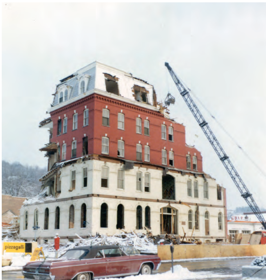
After a few choice architectural elements were removed by owner Pizzagalli Construction, the 94-year-old Pavilion came down quickly in December 1969.