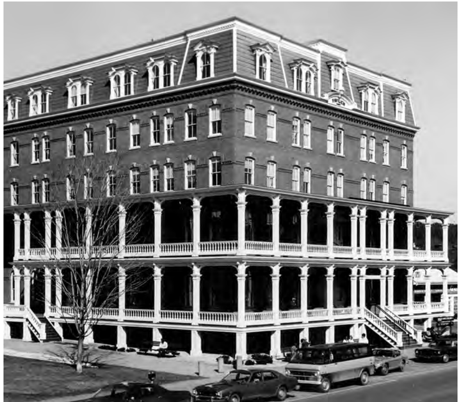
The reconstructed Pavilion building was located 10 feet to west of its predecessors, creating a plaza along its grand side entrance and straightening the city street on the other side of the building.

From there, the proposal to save the Pavilion went back to the House, where