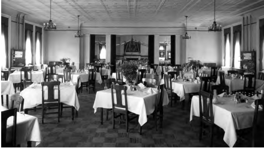
The Pavilion dining room, seen here in its 1932 décor, was the scene of many banquets during the building's 94-year run.