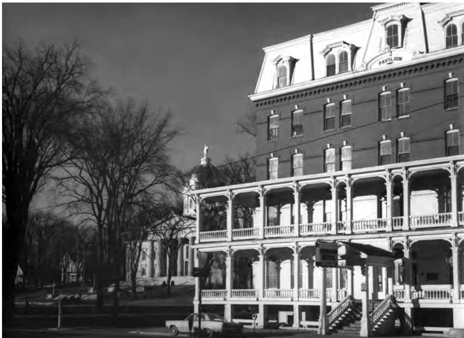
By 1968, when this photograph was taken, the Pavilion Hotel had been closed for two years. Several years prior the bricks under the verandas had been painted white, perhaps to make it look more modern. Although the building had lost some of its charm, its premiere location next to the statehouse remained undiminished.

it failed again. "Supporters will need a miracle to save their building this time," a newspaper opined on April 17. Two days later a new deadline was created and the same newspaper reported that the building had received a "breath of life." A six-member panel was created with a mandate to negotiate a deal by September 1 for the sale of the Pavilion to a private company. The aim was for a private buyer to renovate the building and lease it back to the State; otherwise the building would be torn down on January 1. The belief that no company would be willing to take on such a risky project convinced the "demolishers" to sign on to the compromise.