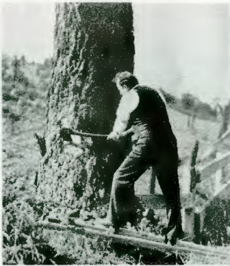
A Lieutenant-Governor, representing a Governor, wields a Roadside Ax