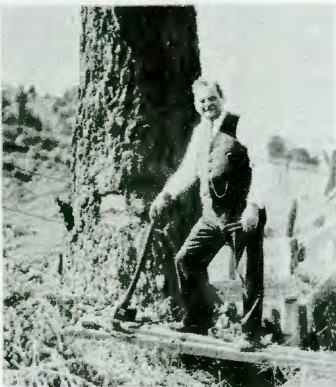
Why not, then, All of Us