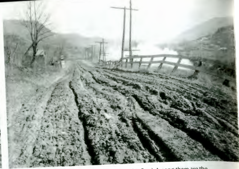
These snapshots, taken by Taylor in the late 1920s and early '30s, represent some of the things he wished to change (several are listed on this flyer). Among them are the blight of billboards (above, left; along Route 7 near Burlington); unpaved, all-but-impassible muddy roads (above, right; near Bolton on present-day Route 2); roadside clutter (below, in West Bridgewater); and dead trees and "raw slopes" seen near Richmond (bottom).