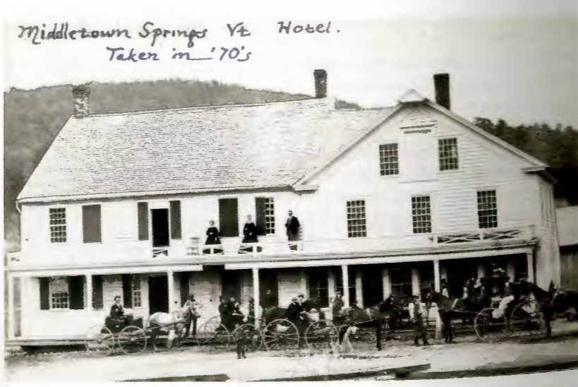
The brochure at left was produced to attract visitors to Montvert, the luxurious, spring-fed hotel in Middletown Springs. The Valley Hotel (above) was an older and more affordable alternative to the Montvert. In 1897, rooms at the Valley Hotel were $1.50 per night, while those at the Montvert were a hefty (for the times) $3.50 per night.