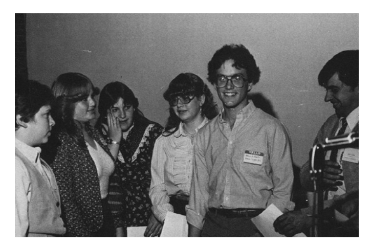
Students from Black River High School at the first Vermont History Day in 1983

New Collections Manager, Teresa Greene, is in the process of evaluating and updating data on our object collections to pursue upgrading to a cloud-based system. This update will allow us to access our database from either of our locations and remotely from local historical societies. The evaluation is also initiating the standardization of data, which will help us make our collection publicly available online. Teresa has hit the ground running by changing location formatting on over 5,000 objects. Only 20,000 to go!