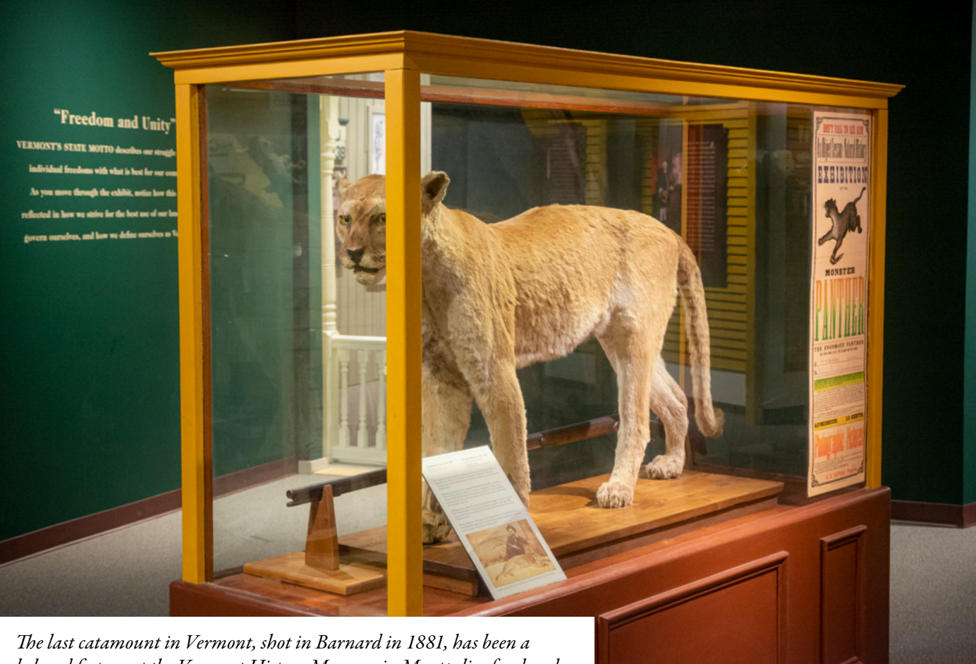
beloved fixture at the Vermont History Museum in Montpelier for decades.

In the 20th century, Vermonters – alongside others worldwide - developed a new understanding of the environment regarding the mountains and forests as a cohesive ecosystem. The catamount shifted from a terrifying and dangerous creature to a noble and charismatic one in the public eye.