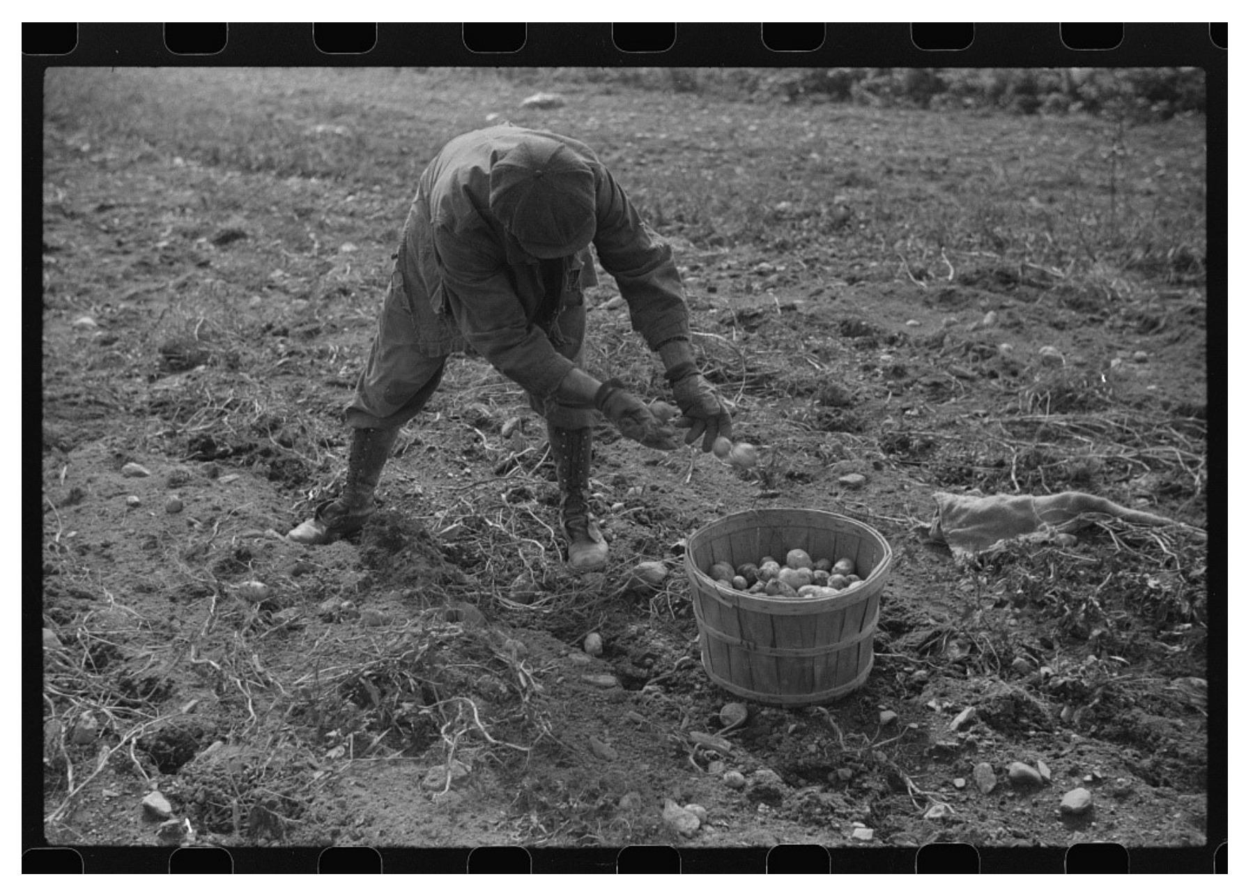
Vermont Historical Society