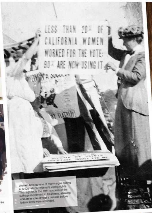
Women hold up one of many signs during a 1910s rally for women's voting rights. This sign touts the 1911 success of the suffrage movement in California, allowing women to vote almost a decade before federal laws were amended.