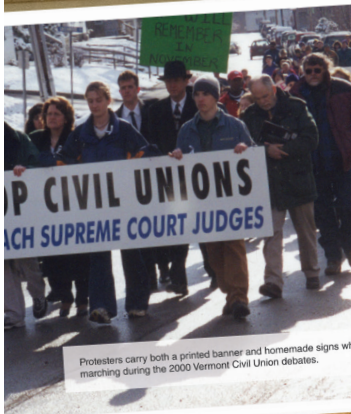
Protesters carry both a printed banner and homemade signs while marching during the 2000 Vermont Civil Union debates.