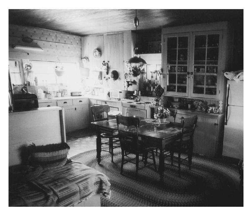
Carrie Somers's kitchen. The china closet and cupboard incorporated windows and doors from the family's previous farmhouse.

gathered there for their meals. She also enclosed the back porch and later added another over the front door.